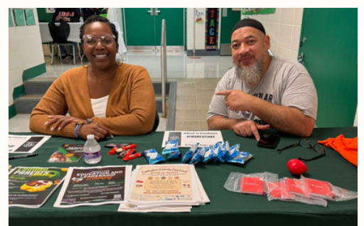
CPSU Connects with Camden Families at Forest Hill Back to School Night, Highlighting Leadership and Advocacy Opportunities