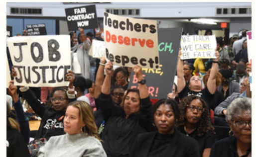
Teacher Layoffs and School Closures Hit NJ Districts Amid Budget Shortfalls